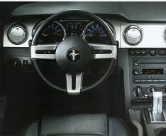
Mustang interior shown with Interior Upgrade Package. All models shown.

Mustang's all-new interior has a true racing feel, from the front bucket seats to the authentic twin-cockpit instrument panel design. The optional Interior Upgrade Package adds satin-aluminum accents throughout, along with a leather-wrapped steering wheel and a six-gauge instrument cluster with Mustang's exclusive color-adjustable MyColor feature. 11