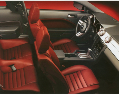
Mustang interior shown with Interior Colour Accent and Interior Upgrade Packages.